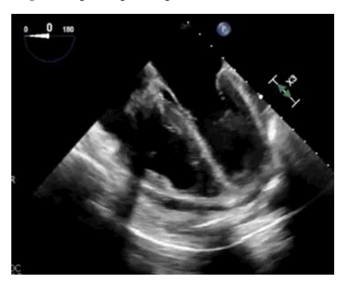
Figure 4. TEE 4 chamber view showing vegetation on the tricuspid valve and the VSD