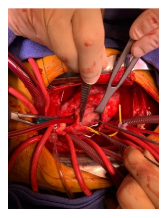
Figure 3. Surgical image showing the VSD between the LV and RA