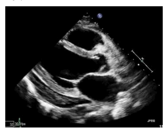
Figure 1. TTE with parasternal long axis showing flail aortic leaflet and purulent pericardial effusion

sided jugular venous distension (JVD), and a pulsating liver. He was also found to have some right upper quadrant abdominal pain. Continuous telemetry morning showed variable heart block ranging from Mobitz type I to third-degree AV block. A repeat TTE showed moderate aortic regurgitation, the flow of blood from around the aortic valve prosthesis into the RA suggestive of recurrent gerbode defect, and severe tricuspid regurgitation with a mobile vegetation on the tricuspid septal leaflet. Patient then underwent transesophageal echocardiogram (TEE) for further examination and was found that the tricuspid vegetation that was identified on TTE was, in fact, a dehisced patch repair of the gerbode defect in the RA with a recurrence and worsening of VSD from LVOT to RA (Figure 4 & Figure 5). He subsequently underwent his second cardiac surgery with replacement of the aortic valve and root with a 23 mm homograft valve conduit and a bovine pericardial patch repair of the VSD along with tricuspid valve repair. Postoperatively, he continued to remain in complete heart block and subsequently underwent placement of Micra leadless PPM a few days after the surgery.