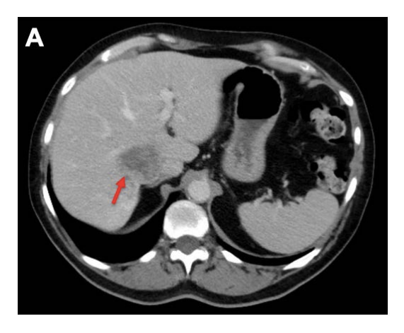
Figure A. Portal venous phase of contrast CT scan showing a lobulated, poorly demarcated liver lesion (red arrow) without clear washout and partial nodular ring enhancement

a malignant neoplastic process was noted. Thus, the patient was discharged with the diagnosis of sclerosing hemangioma of the liver and it was determined that no further surveillance was indicated.