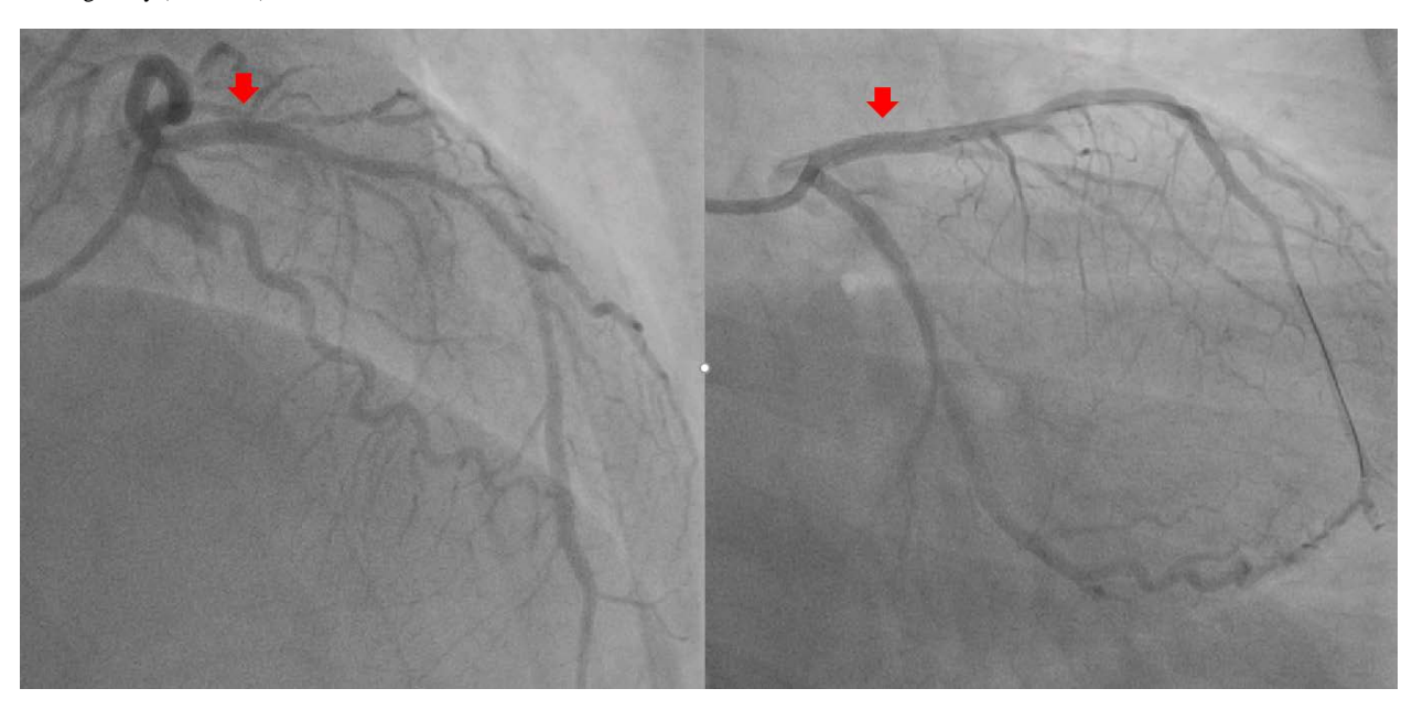
Image 4. Coronary angiogram of the left coronary artery after successful placement of the drug eluting stent in the proximal left anterior descending artery