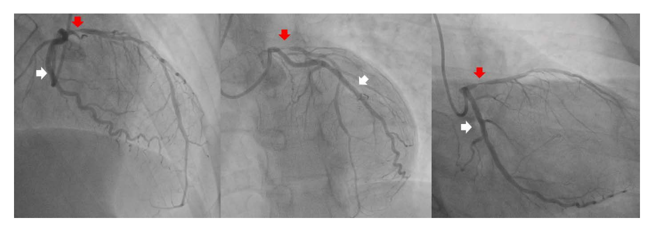
Image 3. Coronary angiogram of the left coronary artery in right anterior oblique cranial view (left), left anterior oblique cranial view (middle), and right anterior oblique caudal view (right) showing normal left circumflex artery (whitea arrow) and subtotal occlusion of the proximal left anterior descending artery (red arrow)