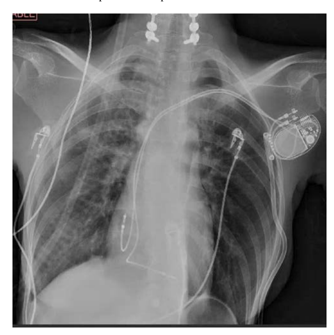
Image 2. Hospital day #3 shows improvement of the left apical pneumothorax

Overall it appeared that the patient was improving when compared to her status in the morning. It was not until much later in the day, during the night, that the patient had significant deterioration in her clinical status. Nursing staff had noticed the patient had significant changes in mental status, the patient was not alert or orientated to self, time, place. Rapid response code was initiated at this time. At this time the patient was already on BIPAP but continued to be altered. Based on the change of the patient's clinical status it was determined the patient should be intubated due to contraindication to BIPAP. An ABG was taken at this time (Table 1) significant for pCO2 of 163, pO2 of 281, pH 7.02, and a bicarbonate of 37. Patient was later transferred to the medical ICU for hypercapnic respiratory failure. Repeat imaging showed