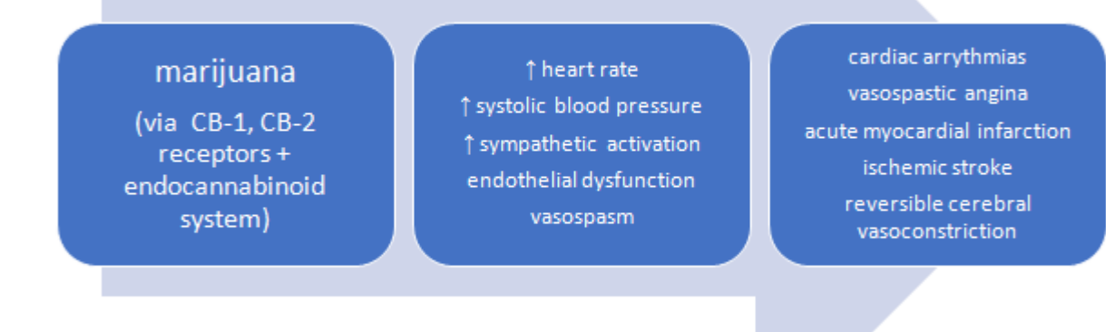
Figure 1. Marijuana effects on the cardiovascular system (CB1 cannabinoid receptor 1, CB2 cannabinoid receptor 2)