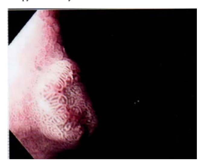
Figure 1. Sessile polyp of approximately 2.5 cm in diameter on the anterior stomach

Subsequently, it was indicated to perform a positron emission tomography (PET Scan) with Gallium 68 on the patient, which was negative. Finally, the patient underwent resection by partial gastrectomy without complications and she was instructed to go to subsequent endoscopic controls every 6 months to assess her evolution, as well as receiving vitamin B12 replacement therapy as necessary.