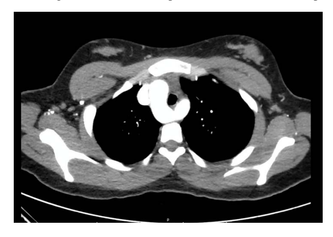
Figure 1. Right-sided aortic arch (RAA) with aberrant left subclavian artery with Kommerell's diverticulum (KD).

Over the next few days the patient's symptoms improved, and she was discharged with close follow up with vascular surgery, gastroenterology and pulmonary clinics. Given these findings, the patient was instructed to avoid exertion, follow up with gastroenterology for a barium contrast esophagogram to detect any esophageal compression, and follow up with vascular surgery for a possible surgical intervention after the delivery. Unfortunately following this admission, the patient was lost to follow-up.