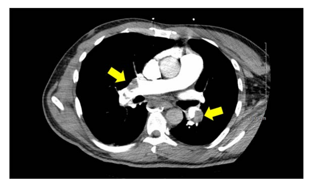
Image 3. CT angiogram of the chest revealing bilateral pulmonary embolism