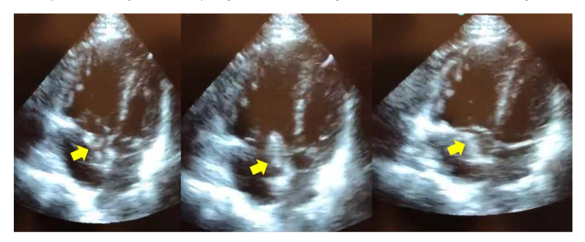
Image 2. A point of care ultrasound showing thrombus in transit (yellow arrow). Also dilated right ventricle can be appreciated