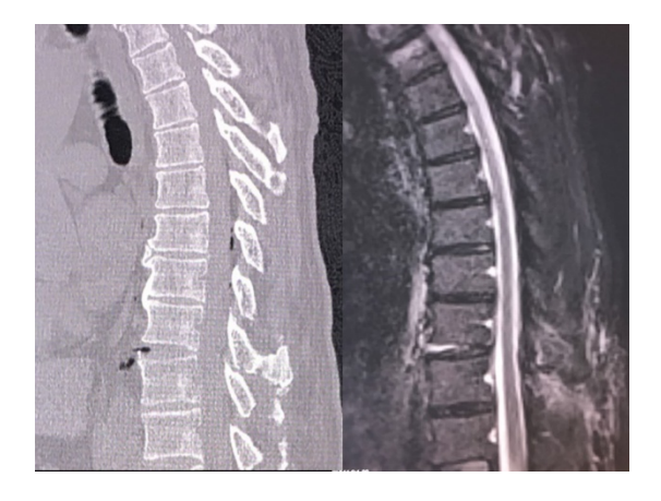
Figure 2. Computed tomography (CT) and magnetic resonance image (MRI) on arrival

CT demonstrates air density at the anterior portion of the 12th thoracic spine (arrow) with fracture of the spinous process (triangle). Left, sagittal view; Right, axial view.