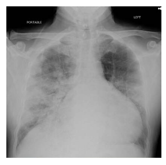
Figure 2. Portable AP Chest X-ray from present hospitalization