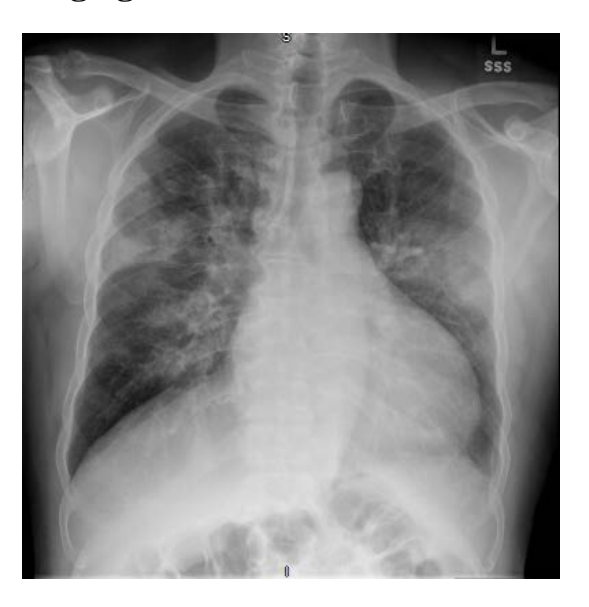
Figure 1. Chest X-ray 2 days prior to presentation