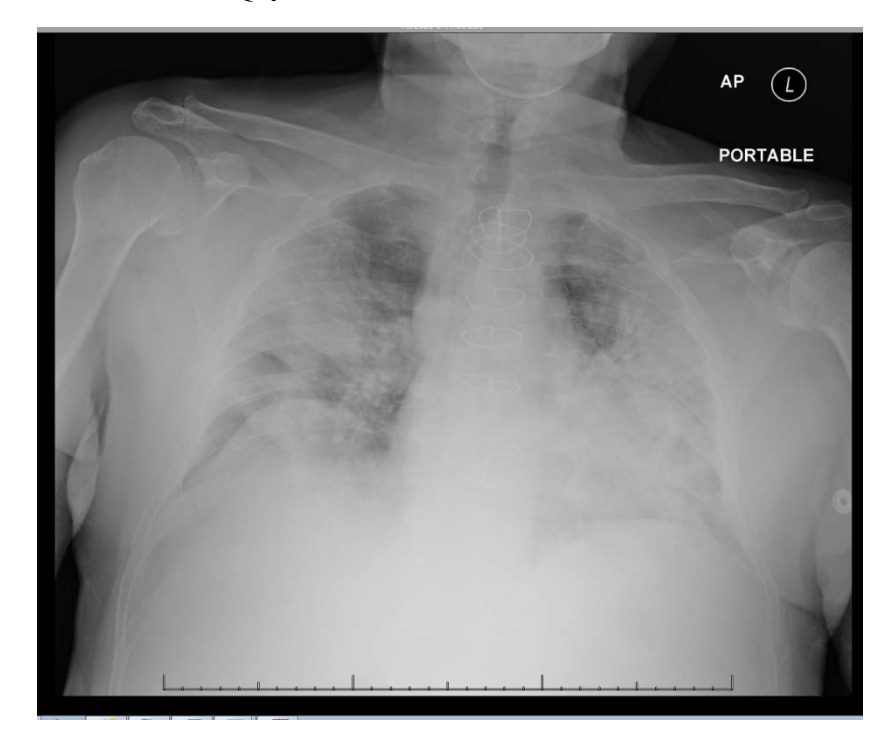
Figure 1. Chest x-ray demonstrated worsening bilateral patchy infiltrates and areas of consolidation

The patient had a mid-line catheter placed into his right antecubital vein on day 4. No arterial line was placed and he had one radial arterial blood gas sampling on day 3. His respiratory status stabilized with the above treatment. On the morning of day 7, his D-dimer was noted to have risen sharply (Figure 2) and the dose of low molecular weight heparin was doubled. In the afternoon of day 7, he complained of new sharp pain in his right hand. On examination, his right hand was cool to the touch and no brachial or radial pulse could be palpated. Point-of-care ultrasound was consistent with flow obstruction in the territory supplied by the right brachial artery (Figure 3). Heparin drip was initiated and he underwent urgent brachial, radial and ulnar embolectomy under general anesthesia. Cylindrical thrombi measuring 0.3 cm to 8.5 cm in length and 0.2 cm to 0.4 cm in diameter were extracted (Figure 4). Post-operatively, right brachial and radial pulses and strong palmar doppler arch signals were appreciated. He was subsequently successfully extubated and transitioned to enoxaparin (1mg/kg BID). Two-dimensional echocardiography did not reveal a cardioembolic source for the thrombus. No underlying hypercoagulable disorder or DIC was identified.