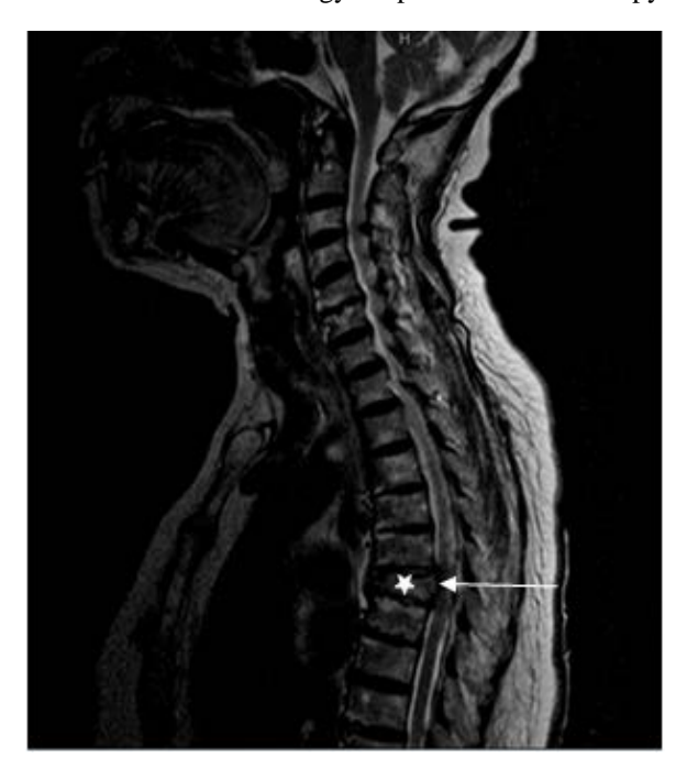
T6 vertebral body biconcave fracture deformity (star), with posterior retropulsion of the wall with spinal cord compression (arrow)

Neurosurgery was consulted, but the patient was felt to be mechanically stable and with symptoms having been present now for over 1-month, surgical intervention was felt to be futile in restoration of neurologic function and the patient was deemed a non-surgical candidate and referred to radiation oncology for palliative radiotherapy.