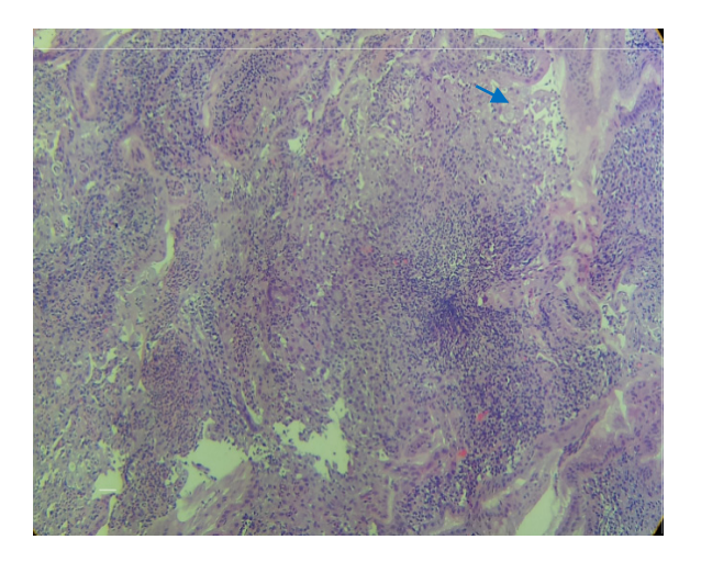
Figure 2. H&E stain of gastric mucosa. Low power magnification showing solid sheets of tumor cells (poorly differentiated) with minimal gland formation (blue arrow)

The patient was initiated on Cisplatin and 5-Fluorouracil and after 2 cycles had transient improvement of her \beta HCG levels to 45 (0-5mIU/ml). She subsequently developed recurrent exudative pleural effusions with cytology that was negative for malignancy. Although cytology was negative, the effusions were thought to be due to gastric cancer. Profound thrombocytopenia and pulmonary hemorrhage then developed, and she had cardiac arrest. The patient passed away within 3 months of initial diagnosis.