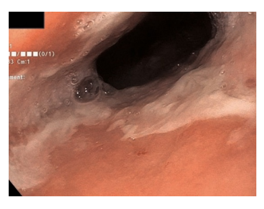
Figure 1. Upper gastrointestinal endoscopy revealing Grade 2 esophagitis

A 72-year-old woman with stage 4 Renal Cell Carcinoma, status post nephrectomy with lung and liver metastases, on Nivolumab therapy for the last 9 months, presented with difficulty in swallowing both liquids and solids of one-week duration. There was no history of diarrhea, constipation, abdominal pain or fever. An upper gastrointestinal endoscopy revealed Grade 2 esophagitis (Figure 1).