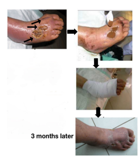
Figure 1. A case of diabetes mellitus type-2 complicated with wound abscess at his dorsal right foot. After debridement, it made three wounds (small arrows). Some significant amount of coffee powder (100gram) put in the wounds (Figure no.2) and wrapped with gauze [2]. The wounds treated without sutures but healed and created an acceptable scar in three months.

coffee powder and the gauze replaced every week regularly without soaking and rubbing of the wound bed. The old coffee powder seated on the superficial wound area usually maintained in its place and not change with the new coffee powder. The procedure keeps the new cells in the wound bed undisturbed.