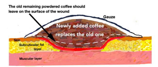
Figure 2. Every dressing changed some of the old coffee powder should remain in the wound surface to save the new cells growing in health under the powder. Then the healing process will continue without any manipulation. It should emphasize the critical function of the old layer of powdered coffee to maintain the healthy growing new cells. It is the reason for not recleaning the wound bed when change-dressing.

The damaging cells result in the slower healing process disturbed by repeated inflammation, and the losing cells require replacements growth (Figure 2).