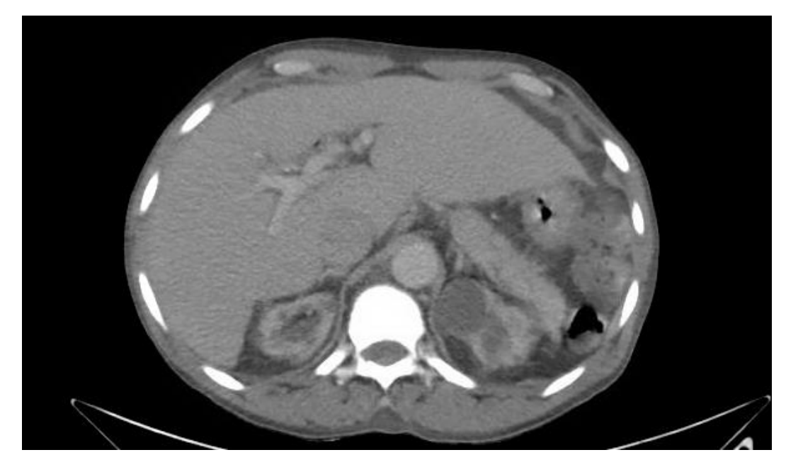
Figure 2. CT Abdomen and Pelvis with IV Contrast with evidence of cholecystectomy and no evidence of biliary ductal dilation. The liver was of a normal contour, with patent portal veins