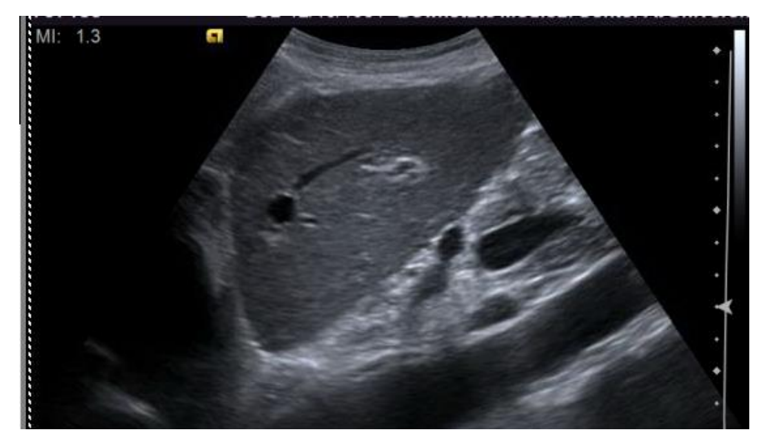
Figure 1. Right Upper Quadrant Ultrasound demonstrates no biliary obstruction with evidence of cholecystectomy

Patient continued to have altered mental status, however a CT Head was negative for acute intracranial pathology. Hyperbilirubinemia causing bilirubin neurotoxicity was proposed as the plausible explanation of the mental status alteration, particularly in the setting of normal ammonia levels. The patient was started on vitamin K for coagulopathy and ursodiol for hyperbilirubinemia. The patient continued to decompensate further and palliative care evaluation recommended supportive therapy. On day 43 patient expired.