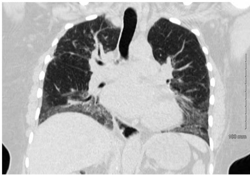
Figure 2. CT chest demonstrates bibasilar predominant diffuse ground glass opacities, minimal associated volume loss and bronchiectasis without honeycombing with stable bi-apical scarring and pleural thickening. Major diagnostic consideration is nonspecific interstitial pneumonia

On examination, her temperature was 37.6°C, pulse of 81 beats per minute, blood pressure 112/75 mmHg, respiratory rate 17 breaths per minute, and her oxygen saturation at rest was 92% on ambient air. The physical exam was remarkable for decreased air entry with bilateral fine inspiratory crackles at the bases. Skin exam revealed multiple, 1-2 cm., firm, painless, subcutaneous nodules located on the extensor surface of both elbows and over the right 3<sup>rd</sup> proximal interphalangeal joint (PIP), the left 2<sup>nd</sup> PIP joint, and the left 4<sup>th</sup> PIP joint. Musculoskeletal exam revealed no joint abnormalities, as such there was no evidence of joint swelling, tenderness, effusion, deformities or decreased range of motion.