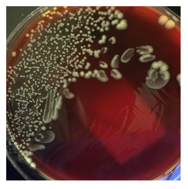
Figure 2. Colonies of R. radiobacter on blood agar