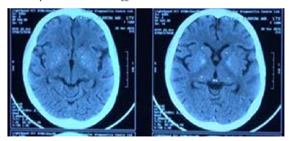
Figure B. CT scan of Brain

Large calcified mass in periarticular soft tissues suggestive of tumoral calcinosis.