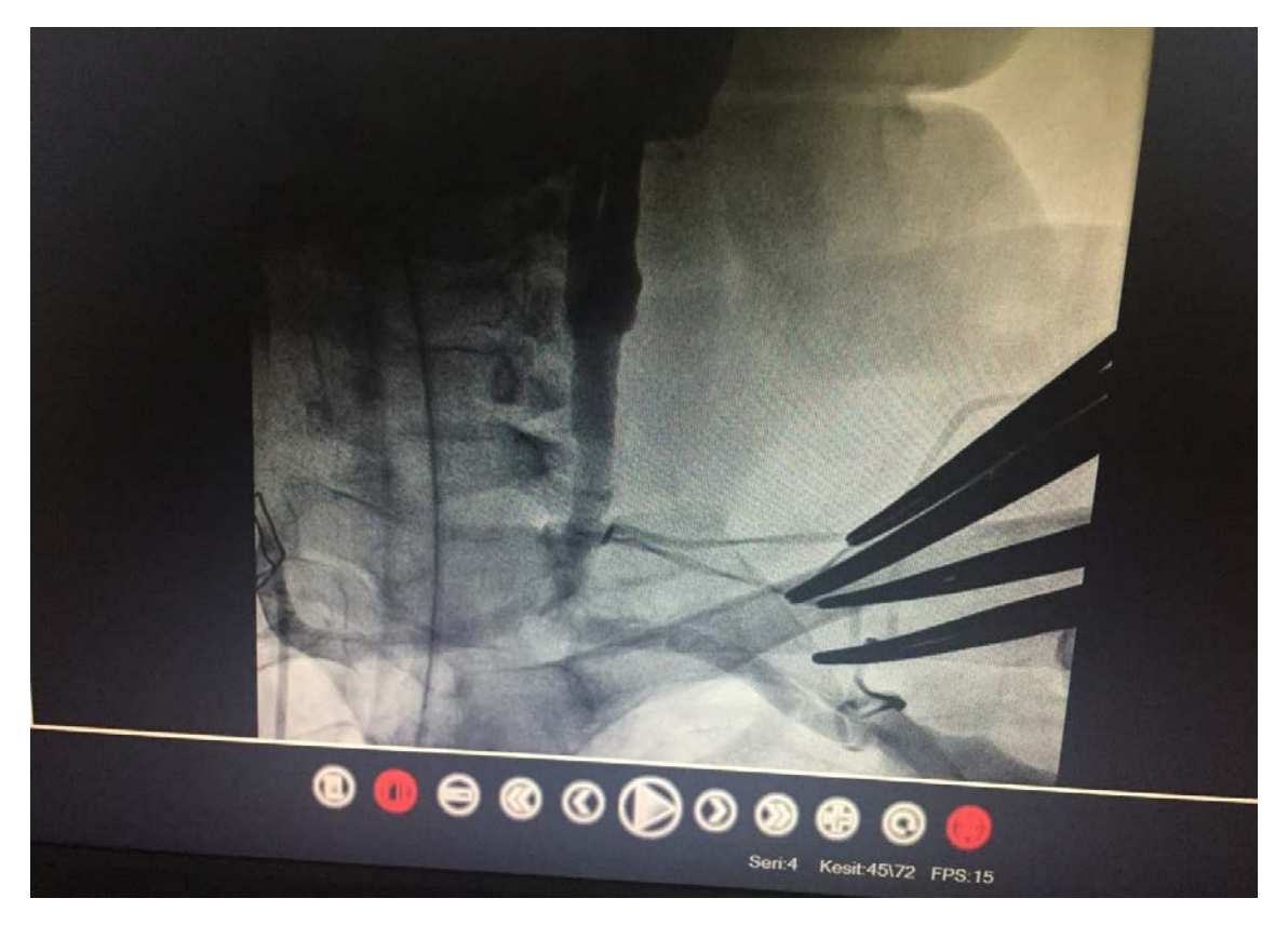
Figure 2. After surgical intervention the patient was transferred to the angiography and catheterization laboratory for endovascular grafting

circumferentially mobilized. Following intravenous administration of heparin at a dose of 50 IU/kg, the carotid artery and its branches were clamped. An end-to-side anastomosis was performed using a PTFE graft with a 6-0 prolene suture. The proximal and distal axillary artery were clamped. The axillary artery was anastomosed using a graft with a 6-0 prolene suture. After bleeding control, the subcutaneous tissue and skin were closed in an appropriate manner. The patient was transferred to the angiography and catheterization laboratory for endovascular grafting (Figure 2).