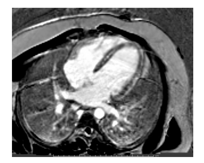
Figure 3. Delayed post contrast cardiac MR four chamber images showing myocardial enhancement in the septum and lateral wall