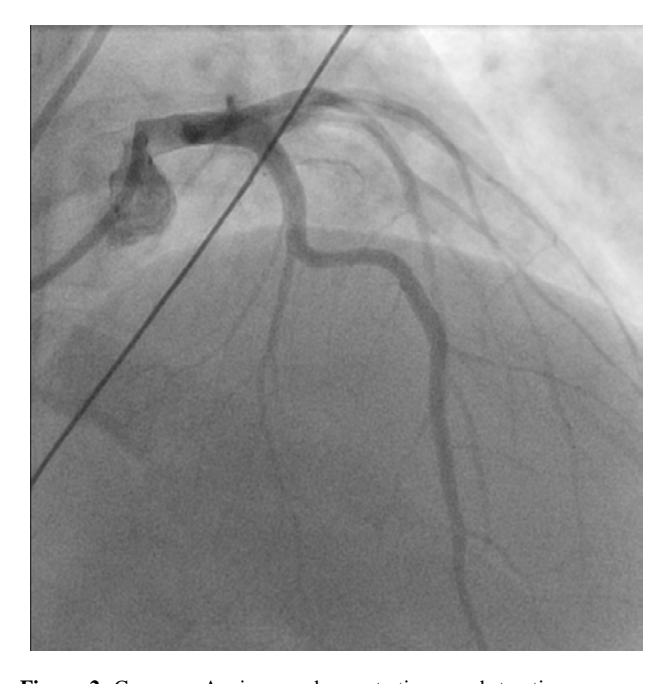
Figure 2. Coronary Angiogram demonstrating no obstructive coronary artery disease in the left main, left anterior descending and left circumflex coronary arteries