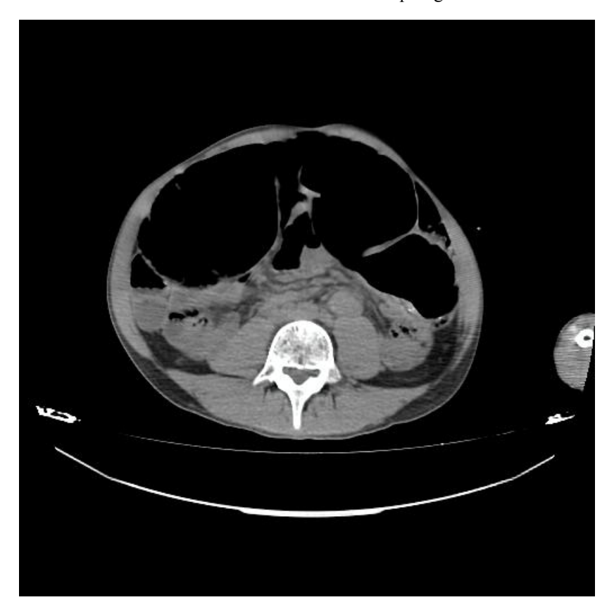
Figure 2. Abdominal scan indicating sigmoid volvulus

specialist center for cytogenetic (chromosomal) analysis, which didn't reveal morphological anomalies of autosomal or X-linked chromosomes. Histopathological examination of the resected specimen was not indicative of Hirschsprung's disease.