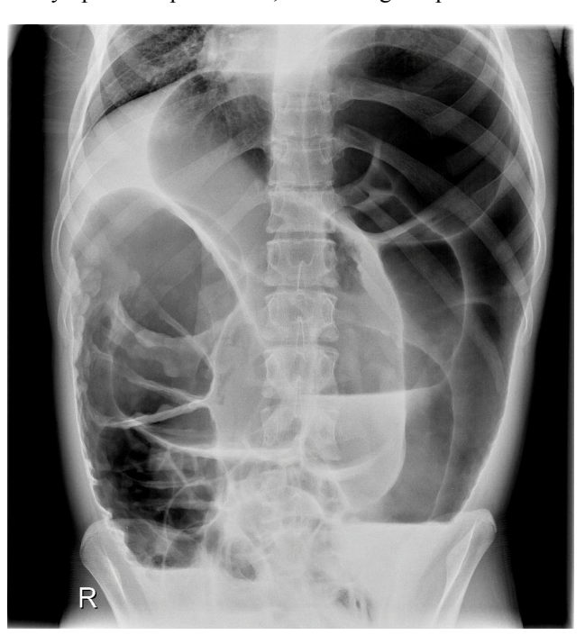
Figure 1. Plain abdominal x-ray indicating dilated bowel loops

clinical examination the abdomen was diffusely distended and tympanic on percussion, with no sign of peritonitis.