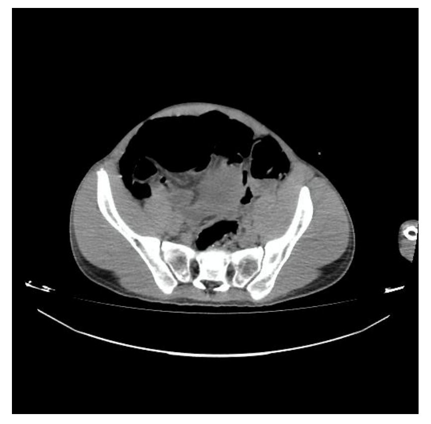
Figure 3. Another abdominal scan view indicating sigmoid volvulus