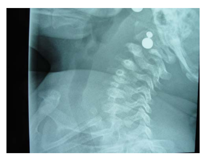
Figure 1. An x-ray film of the neck CT scan of the neck showing an isolated decrease of the lumen in the middle third of the trachea consistent with a tracheal tumor

showed a markedly hyperintense lesion on T2-weighted images at the middle third of the trachea, 1.2 \times 0.8 cm in diameter producing an obstruction of 80% of the airway lumen.