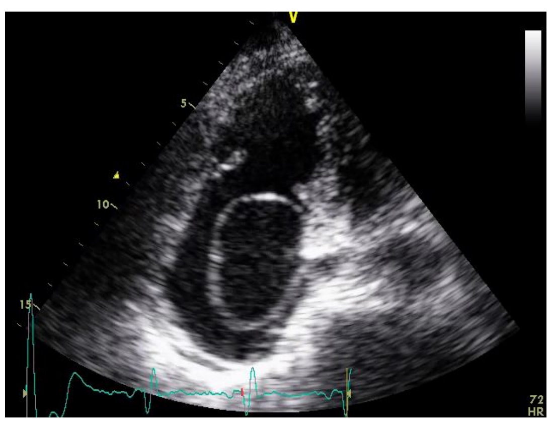
Figure 1. Large ASA bulging into right atrium (type 1R) as seen in transthoracic echocardiography

ASA [3]. ASA is associated with congenital cardiac abnormalities such as patent foramen ovale (PFO) [4], atrial septal defect [3], mitral valvular prolapse [5,6], tricuspid valvular prolapse, marfan's syndrome, sinus of valsalva aneurysm and aortic dissection [7].