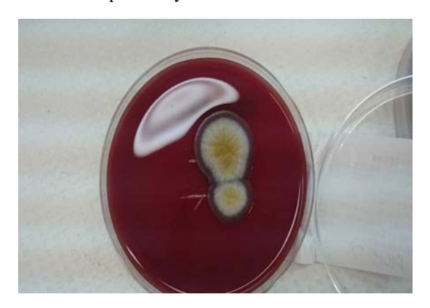
Figure 1. Photographic image of Aspergillus Flavus growth on culture

On the third day of admission, the infiltrate remained the same and re-scraping was done. The results of the culture showed a positive A Flavus infection. A photographic image of the culture is shown in Figure 1. The microscopic examination of the corneal tissue, depicted in Figure 2, also confirmed the diagnosis. Based on this, vancomycin and ceftazidime were stopped and the patient was shifted to voriconazole 400mg as a loading dose orally and then 200mg every 12 hours plus amphotericin B 0.1% eye drops every 2 hours, fluconazole 0.2% eye drops every hour, sodium hyaluronate 0.1% eye drops four times a day, cyclopentolate 0.1% eye drops three times a day and moxifloxacin eye drops three times a day as prophylaxis; all for the right eye. Then the patient was followed up on daily basis.