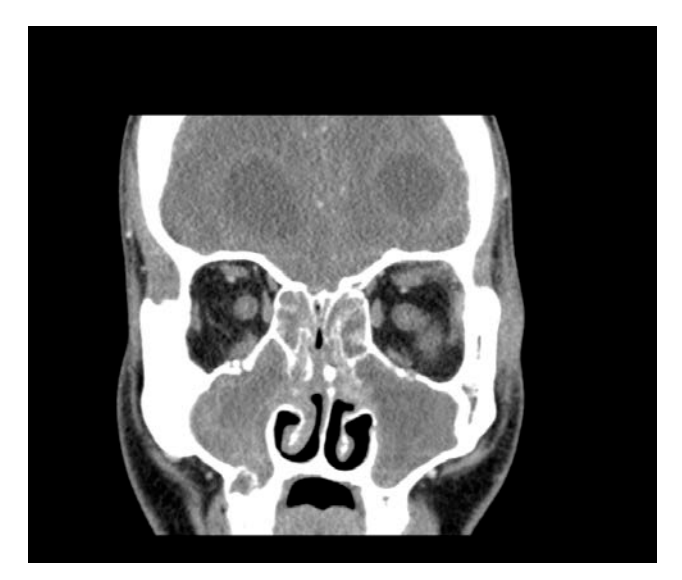
Figure 1. CT scan of bilateral orbits and sinuses indicating pan-sinusitis and bilateral frontal lobe abscesses

A 36-year-old Hispanic Male presented with a 3 week history of prolonged periods of drowsiness. He was recently treated as an outpatient with antibiotics for a left eyelid infection 2 weeks prior. Our patient also reported