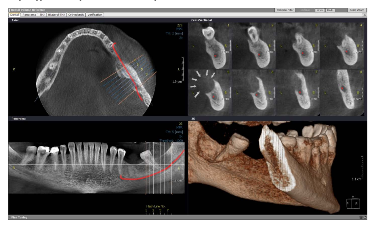
Figure 1. Axial, Cross sectional, Panorama and 3D CBCT images represent a well defined radiolucent lesion (white arrows) with perforation (white arrowheads) in the posterior area of left mandible

MEC.Then the patient underwent surgery and the lesion completely excised with wide surgical margins