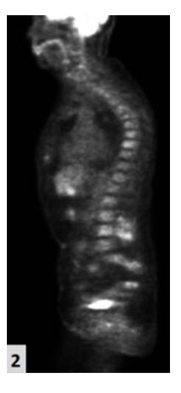
Figure 2. Whole body PET-scan reveals diffuse bone lytic lesions, with hyper-metabolic adrenal mass but no signs of a primary malignancy

Based on these results, an extensive review of the patient's gynecologic history was undertaken. She had a screening mammogram one year prior to the onset of symptoms which has been negative for malignancy. She never had any abnormal results on previous mammography. She had three normal pregnancies with no history of hormonal replacement therapy or oral contraceptive use. There was no family history of breast, ovarian, uterine and colon cancer. She underwent a positron emission tomography (PET) scan; which was remarkable for extensive bony metastatic disease and a heterogeneous hyper-metabolic adrenal mass concerning for metastatic disease (Figure 2-Figure 3). Patient was started on endocrine therapy that included a daily aromatase inhibitor and monthly Denosumab for bone metastasis. At hersix month follow up, PET-scan showed stable disease. Currently, she remains on the same hormonal regimen with monthly follow up at the oncology clinic.