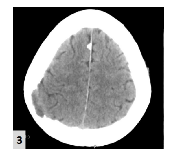
Figure 3. Post-bone marrow transplant head CT revealed asignificant decrease in size of themass in the right parietal bone.

mass along the right parietal calvarium with diffuse enhancement of the dura (Figure 1-Figure 2). Patient underwent a computed tomography (CT)-guided biopsy of the mass as well as whole body positron emission tomography (PET)-scan, the latter revealed mild hypermetabolism in multiple bone lesions, including a right fronto-parietal lytic lesion with a diameter of 5.5 x4.7 cm, lesions were also observed in the C2 vertebral body, L1 to L5, pelvis and left proximal femur.