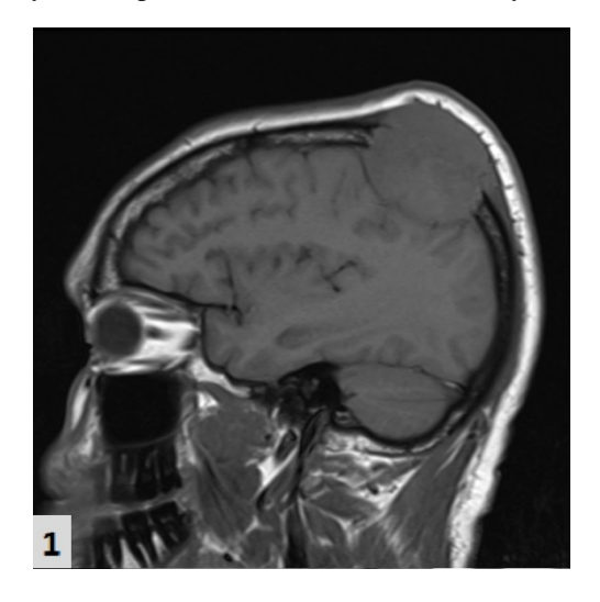
Figure 1. Brain MRIsagittal view, revealed an extra-axial mass located in the parietal calvarium measuring 5.5x 5cm

revealed IgG 10,325 mg/dL, IgA 35 mg/dL, IgM 3 mg/dL, and serum M component of 10.11 g/L, with an IgG kappa monoclonal protein. Imaging studies showed unremarkable cervical and thoracic spine and normal brain magnetic resonance imaging (MRI). Bone marrow biopsy at that time revealed sheets of plasma cell with 90% of the marrow space involved. Flow cytometry showed 55% plasma cells with cytogenetics notable for positive translocation t(4:14)in 46.5% of the cells, which helped classify the neoplasm as an intermediate risk myeloma.