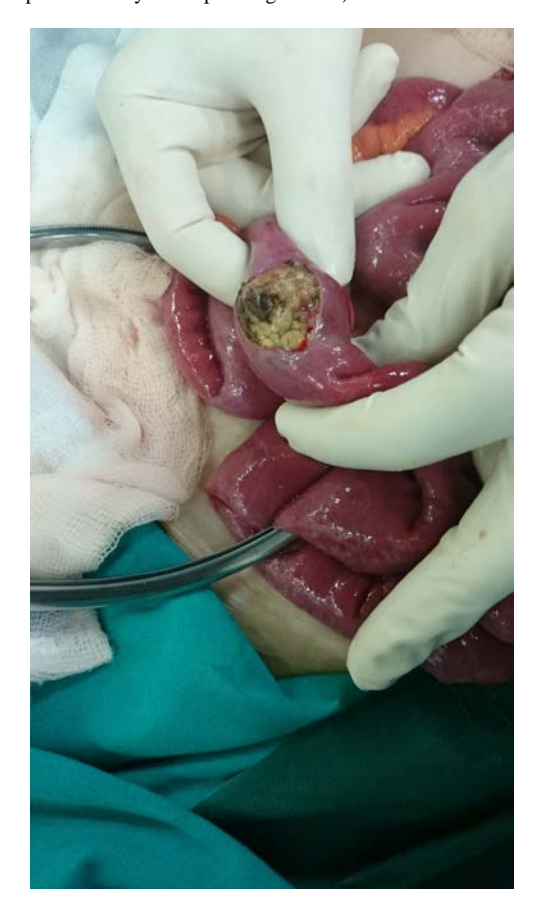
Figure 5. Laparotomy image of the enterolithotomy on the anti-mesenteric surface of the intestine