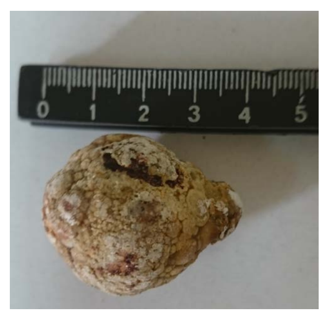
Figure 6. The gallstone.