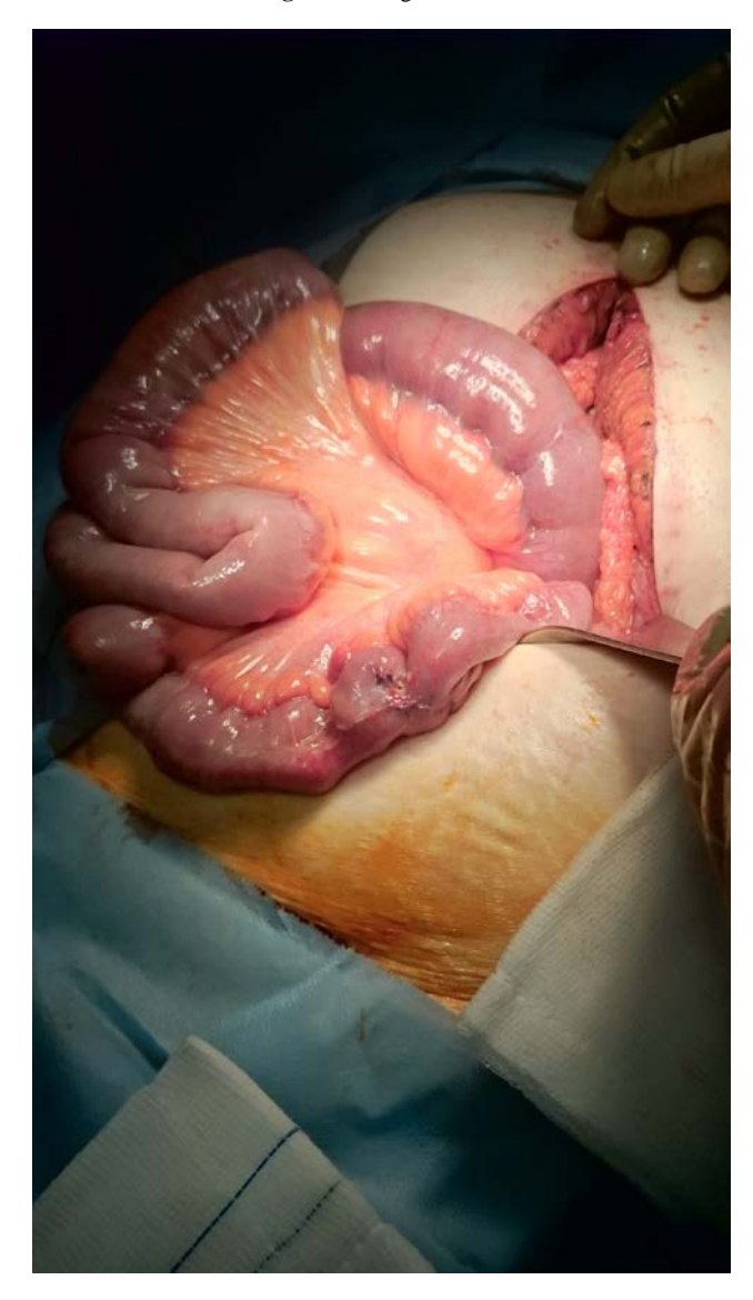
Figure 7. The repair of the enteromy