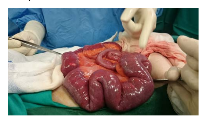
Figure 4. Laparotomy image of the gallstone impacted into the intestinum, with the dilated loops (on the left side of the picture, the pincher points exactly the impacted gallstone)

The operation was uneventful, the patient extubated and transferred to the recovery room. While remaining there, the patient presented acute and severe respiratory deterioration. EKG and heart U/S weren't indicative of myocardial infarct or pulmonary embolism, while plain chest radiograph showed severe ARDS. The patient died two days later in ICU.