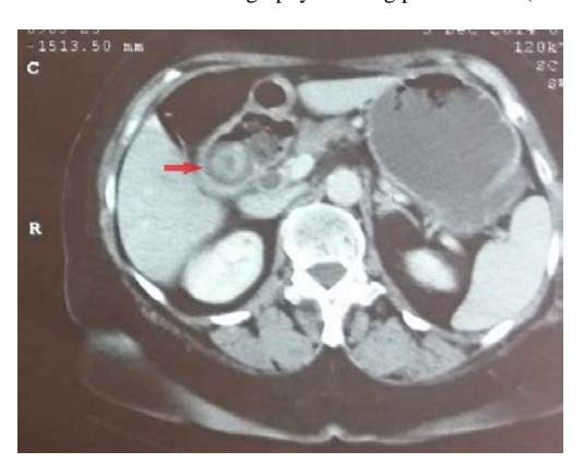
Figure 2. Abdominal CT scan showing a gallstone impacted into the duodenum, the distended stomach and no imagination of the gallbladder (red arrow)