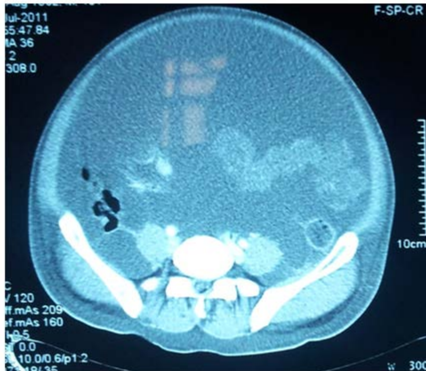
Figure 1. Computed tomography (CT) scans of the abdomen and pelvis showing gross ascites without obvious pathology

mesothelial hyperplasia. In addition, positive mesothelial markers (Calretinin, CK 5/6, Hecton Battiflora Mesothelial cell (HBME)-1) in combination with negative epithelial markers (Carcinoembryonic antigen (CEA), CK 20, Thyroid transcription factor (TTF)-1) were used to distinguish mesotheliomas from the metastatic carcinoma to the peritoneum such as colorectal adenocarcinoma.