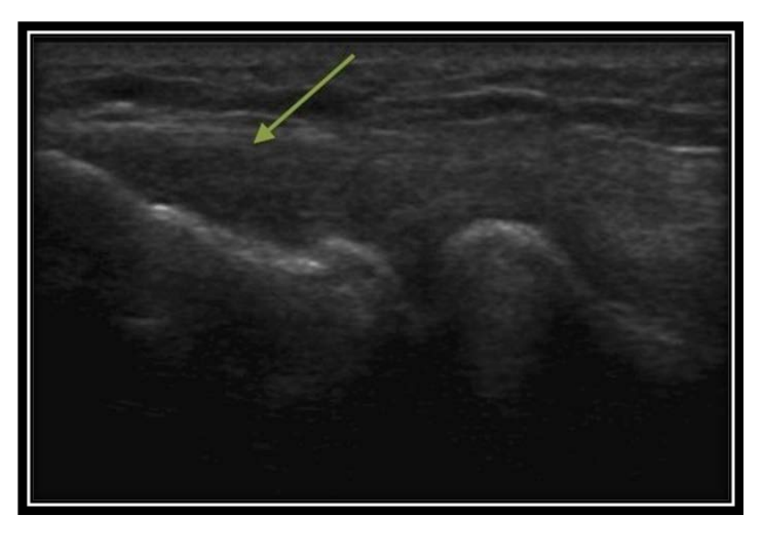
Figure 4.Ultrasound image of the lateral compartment of the elbow that demonstrates thickening and hypoechogenicity of the conjoined tendon of the extensor muscles near the lateral epicondyle (arrow)