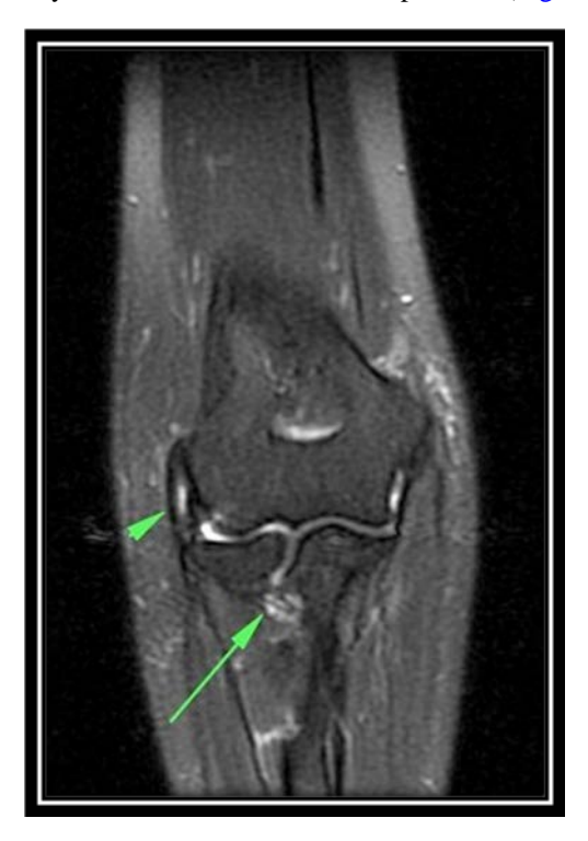
Figure 1. Coronal T2 fast spin-echo weighted fat-suppressed MRI of the elbow. Arrowhead demonstrates the lateral epicondylitis and the arrow demonstrates the high signal intensity changes within the posterior interosseous nerve

the posterior interosseous nerve (Figure 1 and Figure 2). There was also an apparent decrease in thickness and fatty infiltration of the supinator muscle, suggesting atrophy caused by subacute/chronic nerve compression (Figure 3).