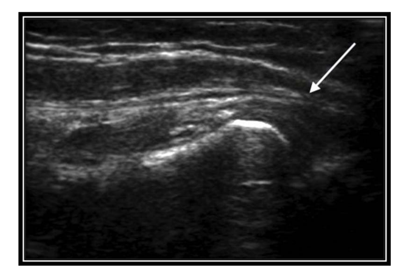
Figure 5. Ultrasound image of the elbow that demonstrates thickening and hypoechogenicity of the posterior interosseous nerve in the region of the "Arcade of Fröhse" (arrow)

Ultrasound revealed thickening and hypoechogenicity of the conjoined tendon of the extensor muscles near the lateral epicondyle (Figure 4), combined to thinning and heterogeneity with fatty replacement pattern of the muscle belly of the supinator muscle. The posterior interosseous nerve was also found thickened and hypoechoic in the region of the "Arcade of Fröhse" (Figure 5), making the PIN compressive syndrome the main differential diagnosis.