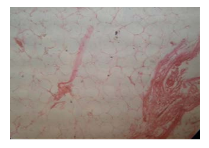
Figure 4. Histopathology slide showing adipocytes