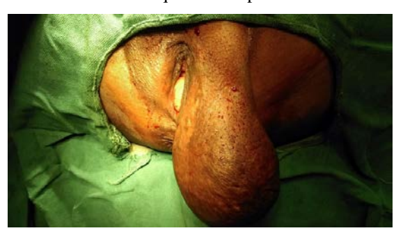
Figure 1. (Mass arising from left labia majora around 9*8*7 cm).

of population [1]. Very few cases of vulvar lipoma has been reported in literature [2,4,5,6,7,8]. Exact etiology for lipoma development is not known but there are speculation regarding potential link between trauma and lipoma formation or increase in size. It has also been suggested that trauma induce cytokines release triggers pre adipocyte differentiation and maturation[9]. While the exact etiology of lipoma remain uncertain, an association with gene rearrangement of chromosome 12 has been establish in cases of solitary lipomas, as has an abnormality in HMGA2LPP fusion gene [10]. Diagnostic imaging with CT, MRI and Ultrasound are useful to asses the characteristic of these tumors and differentiate them from cysts and also to exclude further pelvic involvement [11]. Vulvar lipoma needs to be differentiated from liposarcoma. Preoperative biopsy or MRI is helpful [12]. Complete surgical excision with the capsule is advocated to prevent local recurrence in case of lipoma, while wide local excision will be required for liposarcoma.