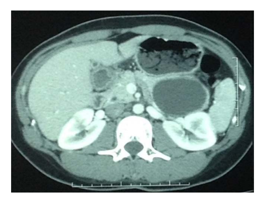
Figure 1. Evaluation of the patient by computed tomography. Axial view showed a unilocular cystic neoplasm dependent of the tail of the pancreas