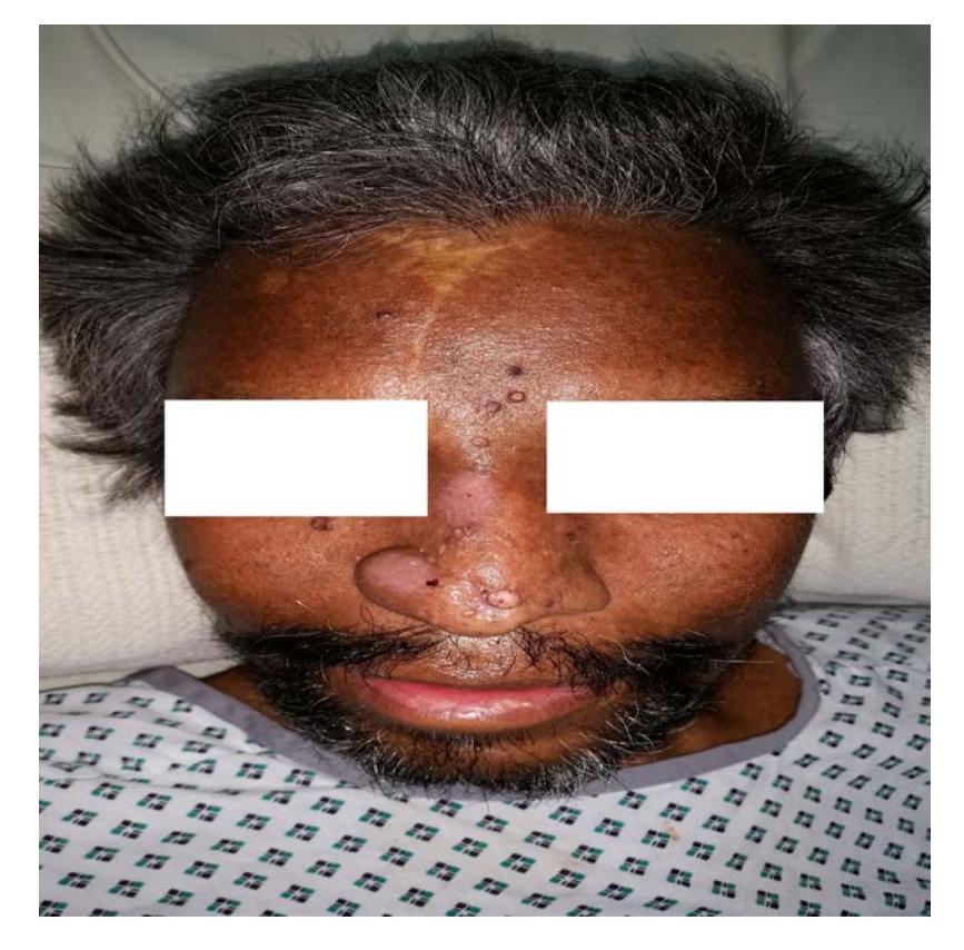
Figure 3. about 1 x 1 cm mass on the tip of the nose, also there is nasal and forehead scars of the previous reconstruction Surgery

Surgical removal of the nasal mass was done and nasal reconstruction with right paramedian forehead flap plus