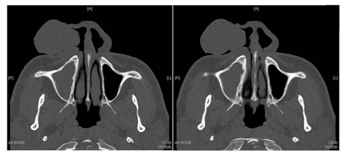
Figure 1. Computed tomography sca showed superficial mass lesion measure 3.5 x 4.2 cm in the right side of the face invading to the adjacent right anterior nasal nostril

with no deep extension, brain parenchyma with in normal, no metastases (Figure 2).