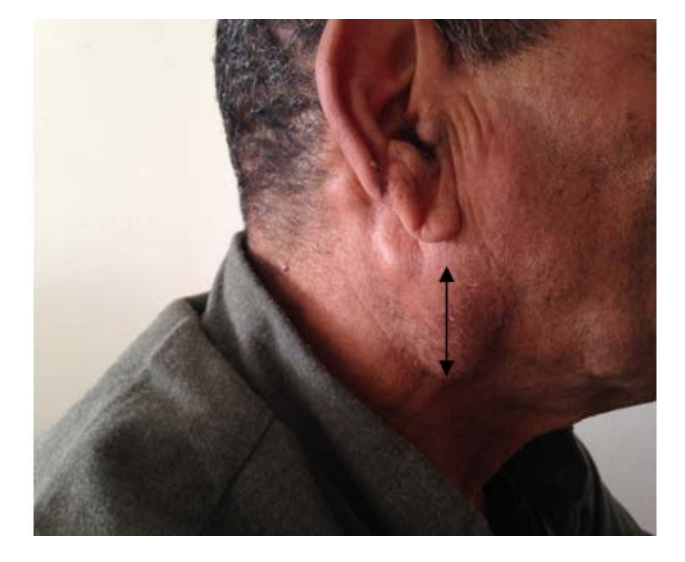
Figure 1. Physical examination showing gross adenopathy

of the other systems revealed peripheral bilateral axillary and inguinal lymph nodes, with no other abnormalities. Splenomegaly and liver enlargement weren't noted on abdominal palpation. Dysautonomia and neuropathy were not seen in neurological examination.