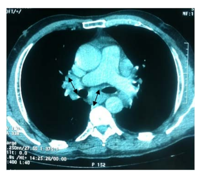
Figure 3. Chest CT showed mediastinal and hilar lymphadenopathy

Lymphadenopathies enlargement due to infection, neoplasmand granulomatuous diseases were considered. Infectious investigations including sputum for acid-fast stain, quantiferon test, tuberculin skin reaction and bone marrow culture were negatives. Endobroncho-alveolar fluid tested negative for acid-fast bacilli. No caseating granulomas in bone marrow and lymph nodes biopsies were found. Further investigations, including research of