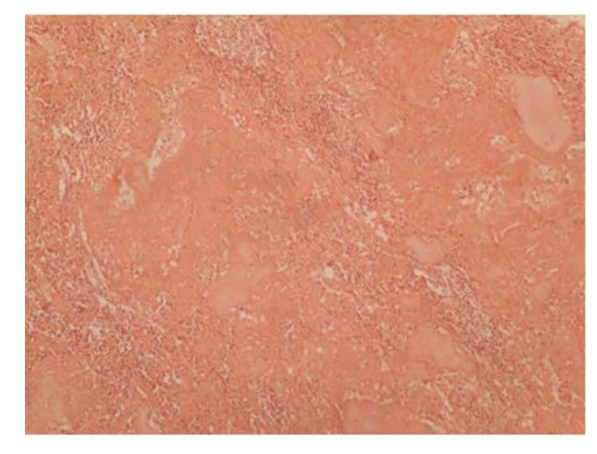
Figure 5. Extracellular deposits positive for Congo-Red staining (original X 100)

The patient was treated at first with colchicine. Followup examination and computed tomography 6 months later showed growth in size of lymph nodes, being painful. A