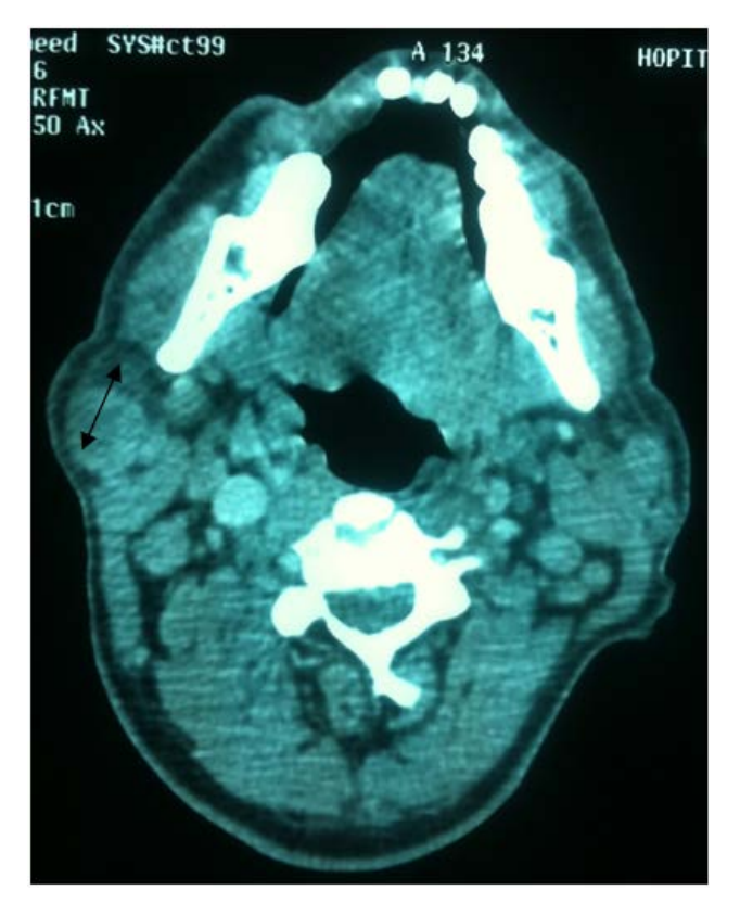
Figure 2. CT scan with medium contrast, showing inhomogeneous enhancement of the masses

value: 50 -250mg/dL). Urine electrophoresis showed positive kappa free light chains. A contrast whole-body computerized tomography (CT) scan showed generalized, lymph node enlargement including cervical (Figure 2), mediastinal (Figure 3), axillary, retroperitoneal and inguinal group localizations with sizes of up to 3x3x3 cm.