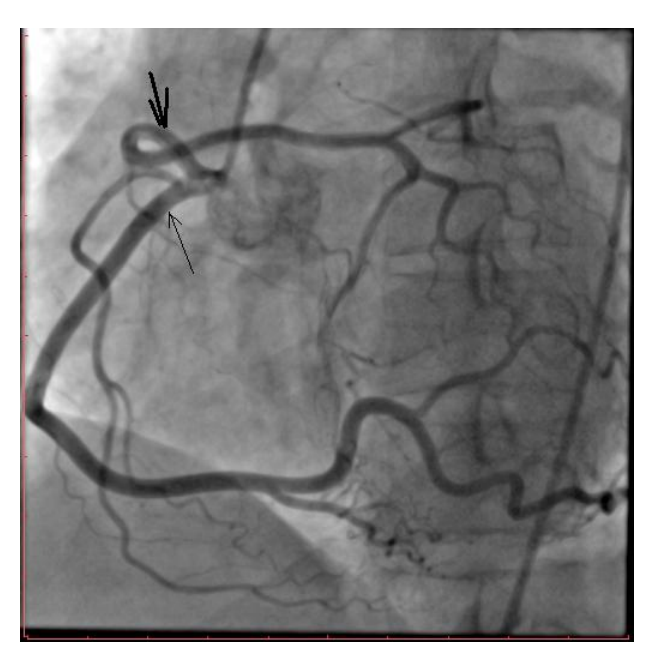
Figure 1. Coronary angiography view showing both left coronary artery(thick arrow) and right coronary artery(thin arrow) originating from right coronary sinus

A 45-year-old male was admitted to the department of cardiology of Sawai Man Singh Medical College & hospital, Jaipur, Rajasthan, India after the recurrent episodes of shortness of breath atypical chest pain not responding to antianginals in form of nitrates. Patient was also evaluated for his shortness of breath for any pulmonary cause but it revealed no abnormality. Cardiac Treadmill Test was inconclusive because test terminated prematurely due to fatigue. He was a smoker and there were no other risk factors and his baseline ECG was normal. The day following hospital admission, coronary