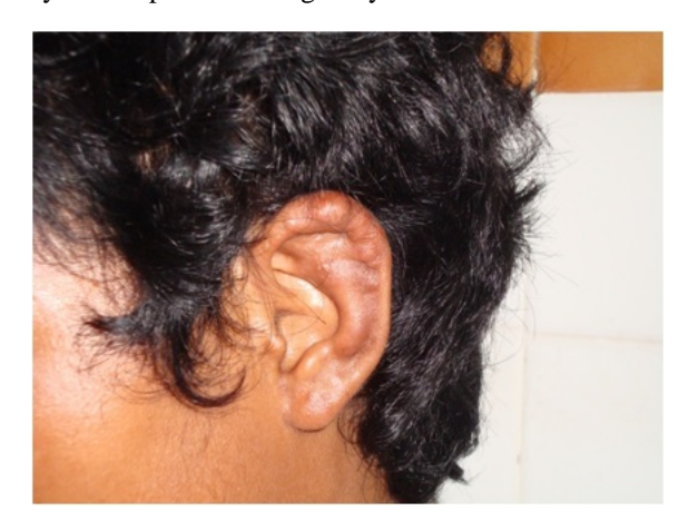
Figure 3. Resolving lesion of left pinna after 1 month of starting treatment

On the basis of this, diagnosis of Borderline tubercular Hansen's disease was made and the patient was treated with multibacillary (MB) Multi Drug Therapy (MDT) regimen comprising Rifampicin 600 mg once a month, Clofazimine 300 mg once a month followed by 50 mg daily and Dapsone 100 mg daily for 12 months.