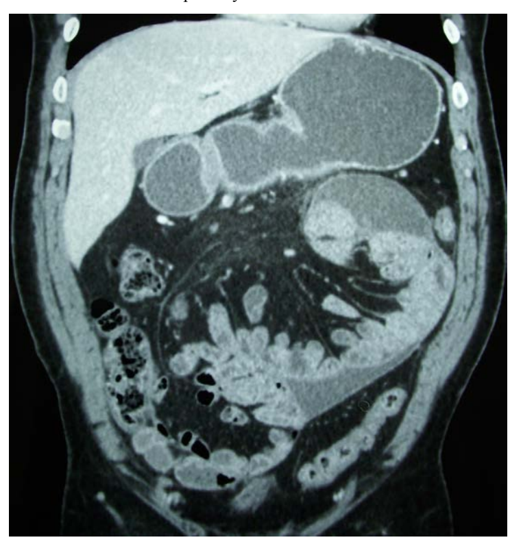
Figure 1. Contrast-enhanced abdomen computed tomography: Conglomerate intestinal loops from the first jejunal loop until the last ileal one in a peritoneal bag with discreet infiltration of mesenteric fat

(idiopathic) and secondary types. Its early clinical features are nonspecific; therefore, preoperative diagnosis is difficult [2,3]. Herein, we present a case of a man who presented with symptoms of intestinal obstruction in which a diagnosis of idiopathic EPS was made preoperatively, and was confirmed by a laparotomy and the histopathology.