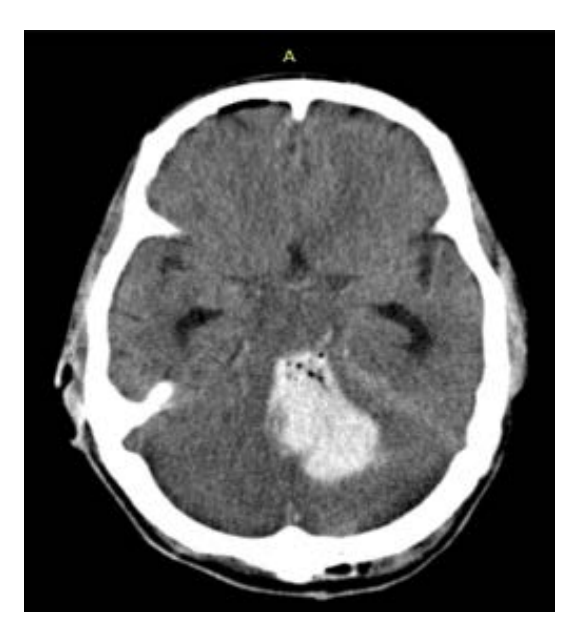
Figure 1. CT scans of the patient

A 56-year old male patient presented to the emergency department with complaint of chest heaviness for several hours associated with vertigo and 6–8 episodes of vomiting. Clinical examination of the patient showed good general conditions with rhythmic pulse. The additional risk factor found along with the above mentioned complaint was hypertension. On arrival, he had no neurological symptoms and his blood pressure was 213/103, pluses 77 beats/minute, body temperature was 99F, respiratory rate was 18 breaths/minute, O2 saturation was 99% on room air and plasma glucose was 4.6619 mmol/l. On initial examination, we did not find any head trauma, abnormal respiratory sound or cardiac murmur. The ECG on presentation had ST segment elevation from leads V2–V4, & T-wave inversions in V6, II, AVL & AVF.