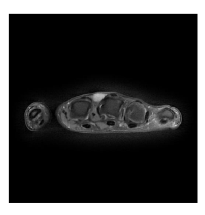
Figure 2. MRI with contrast: superficial subcutaneous well defined mass on the dorsal aspect between 2nd and 3rd MCP joints