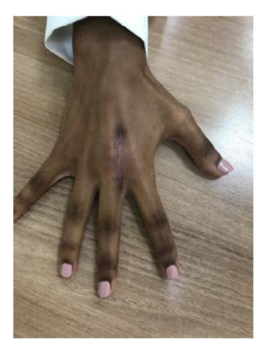
Figure 6. The scar and range of motion at two years post-surgery. Patient consent was obtained

As the tumor cells are noted at the surgical margin and due to un-availably of Mohs's surgery in our center the patient underwent excision for 2nd time and the histology slides sent abroad for an expert opinion and a final report shows a cellular spindle cell neoplasm with admixed multinucleate giant cell and entrapment of hyaline collagen bundles, thus resembling cellular FH- except for the fact that there are multifocal scattered, mainly mononuclear cells with enlarged irregular atypical vesicular nuclei and more copious amphophilic cytoplasm. The tumor involves the excision margin and was advised to undertake further re-excision. Re-excision with a wider margin under frozen section was done and the final histopathology confirmed a clear margin. She was kept on regular follow-up and referred for hand physiotherapy. She was seen at 6 months follow-up post-surgery there was no clinical evidence for recurrence, the scar was well healed, and the patient had full range of motion of fingers. She is on regular 6 monthly follow-ups and the last follow up was two years post-surgery with a well-healed scar and normal hand function (Figure 6, Figure 7).