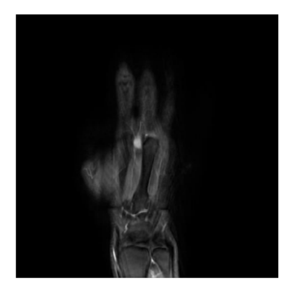
Figure 3. MRI with contrast: superficial subcutaneous well defined mass on the dorsal aspect between 2nd and 3rd MCP joints