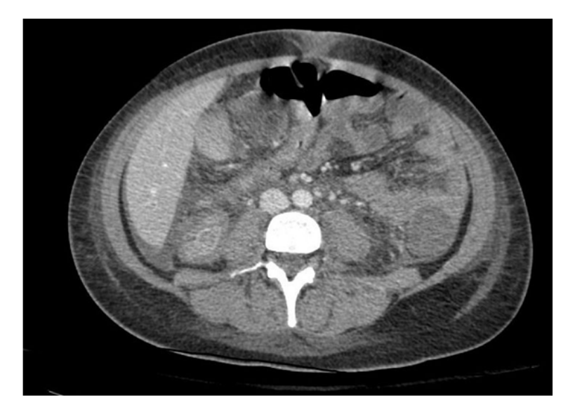
Figure 4. C.T. Abdomen/Pelvis with IV contrast showing colonic wall thickening indicative of colitis