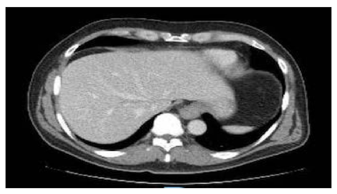
Figure 3. CT of the abdomen and pelvis with IV contrast after four weeks of antibiotic treatment showing resolution of the hepatic abscess