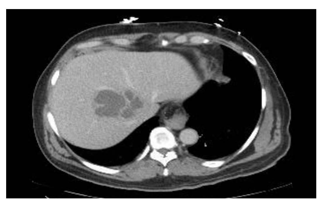
Figure 1. CT of abdomen and pelvis with IV contrast showing a 5.5 x 8.9 x 9.8 cm mass with multiple loculations in the right and caudate hepatic lobe compatible with an abscess

The patient was admitted for the management of septic shock secondary to a hepatic abscess. Blood cultures grew Klebsiella pneumoniae. Ova and parasite exams showed Strongyloides stercoralis larvae. Antibodies for Entamoeba histolytica, HIV, and HTLV-1 were negative. Interventional radiology specialists recommended against abscess drainage due to its complexity and location. The patient initially received treatment with ceftriaxone 2g intravenous daily and metronidazole 500 mg intravenous three times daily for five days with some improvement in presenting symptoms and subsequently was discharged home on cefuroxime 500 mg oral two times daily with a recommended total therapy of six weeks. Approximately two weeks after discharge, the patient started to experience new episodes of fever and returned to the emergency department for evaluation. An abdominal CT