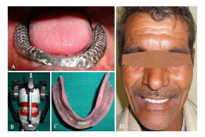
Figure 4. (A) Intra oral view showing a well-adapted metal base (B) Trial dentures mounted on semi adjustable articulator (C) Metal base fitted within the acrylic denture base (D) Dentures in place

maxillary residual alveolar ridge while the mandibular ridge was resorbed. Other intra oral features were within the normal limits. The occlusal surface of the ridge was wavy with some areas higher than the other (at four places). Irregularity of the mandibular residual alveolar ridge was also present in the lateral direction. Treatment options given to the patient was an implant supported fixed or removable prosthesis which was rejected due to economic issues. The second option he consented was maxillary and mandibular complete denture with mandibular denture having a hybrid of metal and resin denture base. Routine clinical and laboratory procedures for the fabrication of complete denture were performed. A metal denture base (Wiron 99; Bego, Bremen, Germany) was tried in the patient mouth for adaptation (Figure 4A). Teeth were then arranged on casts mounted on a semi adjustable articulator (Artex; Girrbach Dental) (Figure 4B) following which a trial was done. Final denture was processed with heat cure denture base resin (DPI, India) (Figure 4C) and denture was then delivered to the patient who reported at his follow up that he was satisfied with the outcome of the treatment.