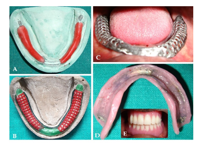
Figure 2. (A) Wax spacer to relieve residual alveolar ridge (B) Wax pattern placed on the refractory cast (C) Metal base during clinical trial (D) Final denture for maxillary and mandibular arches