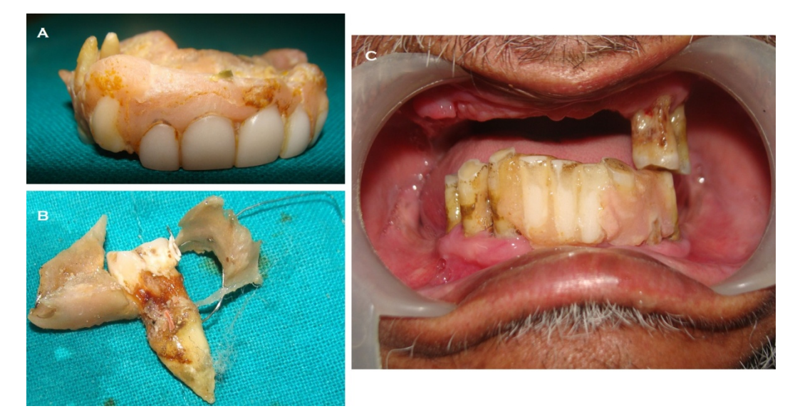
Figure 1. (A) Partial denture attached to natural tooth (B) Natural tooth that served as abutment extracted along with the faulty prosthesis (C) Intra oral view after removal of maxillary partial denture along with the mandibular faulty prosthesis

The normal functioning of mucosa is dependent on many factors and the complexity of interaction between them is presented in Figure 3. The intrinsic factors include the influence of various major body systems like cardiovascular, immunologic, metabolic, neural and endocrine primarily besides minor influences by the condition of excretory, respiratory, digestive and lymphatic systems. [5] Each body system in turn has a genetic and environmental influence, the difference between the two being that genetic is predetermined and one within an individual, although it may change through generations while the environment is a two-way track in which changes take place dynamically and is time dependant.