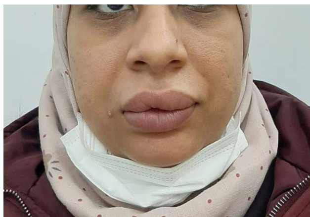
Figure 3. Total regression of lip edema after colchicine treatment

(Figure 3), clear regression of macroglossia and lingual fissures (Figure 4), and absence of recurrence.