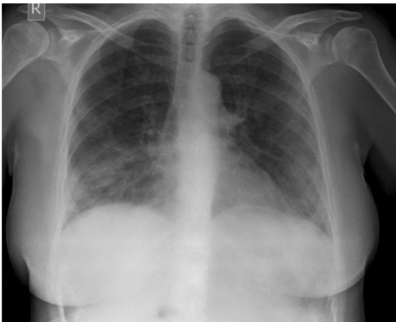
Image 1. Chest X-ray showing bilateral congestion to the middle and lower lung fields

On further investigations, the chest X-ray revealed bilateral congestion to the middle and lower lung fields (Image 1). The electrocardiographic (ECG) findings had sinus tachycardia. Troponin and the rest of the cardiac enzymes were normal. Her blood-work showed no electrolyte abnormality and had normal urine analysis. Transthoracic Echocardiography (TTE) showed normal findings with no chamber or valvular abnormalities and normal ejection fraction. A provisional diagnosis of negative pressure pulmonary edema was made. She was placed in a high fowler position and given oxygen therapy via a face mask. 80 mg of Lasix(Furosemide) was given initially followed by 40 mg after 6 hours. Input and output charting was done with close monitoring of vitals. All her symptoms resolved within 12 hours and she felt symptomatically better.