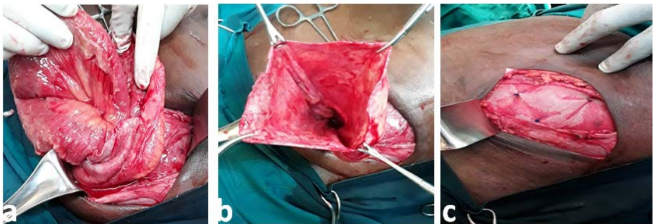
Figure 3. (a) Peritoneal sac opened to expose content. (b) Peritoneal sac with content reduced (c) On-lay mesh repair