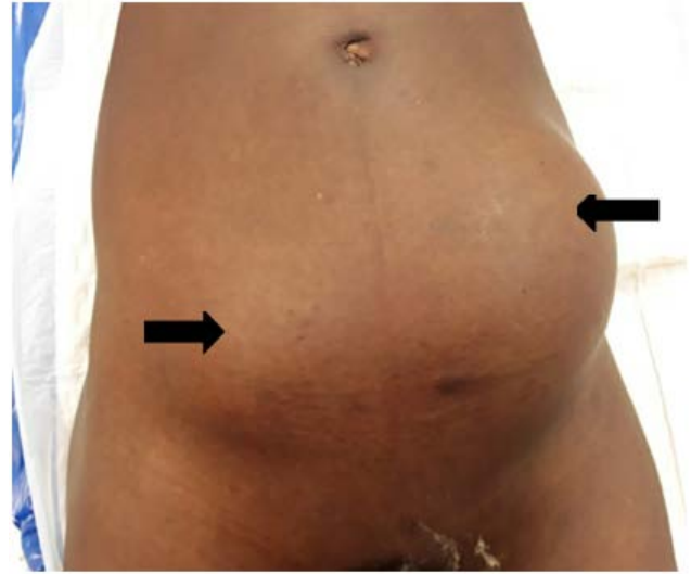
Figure 1. Bilateral spigelian hernia showing abdominal lumps

These findings are illustrated in Figure 2a, Figure 2b and Figure 2c. Complete blood count and renal function tests were essentially normal. A diagnosis of Incarcerated Bilateral Spigelian Hernia was made and the patient counseled for immediate operative intervention.