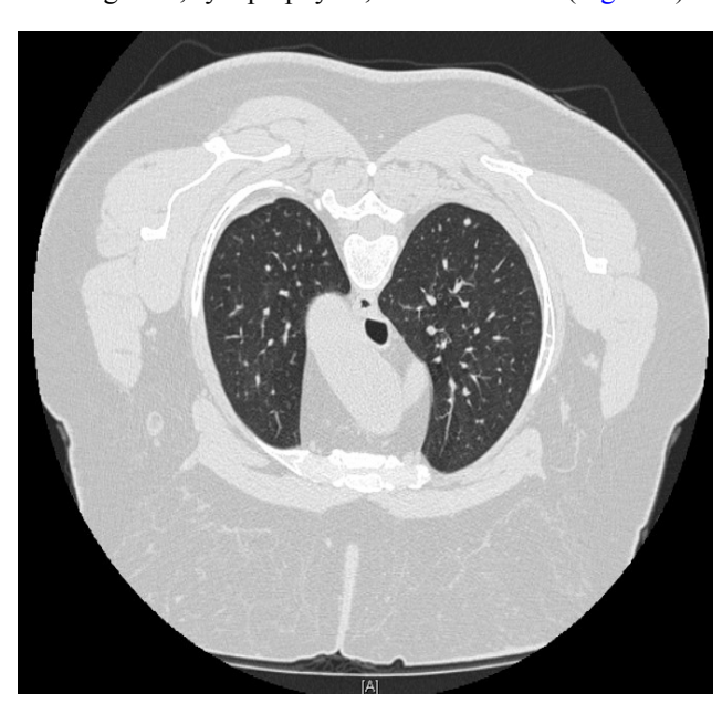
Figure 1. Computed Tomography of chest revealing tumorlets

edema. Abdominal examination revealed no distention or shifting dullness. Pulmonary function test showed a restrictive pattern, with FEV1 75%, FEV1/FVC 88% and TLC 67% of predicted. High resolution chest CT revealed multiple non-calcified, well circumscribed pulmonary nodules scattered throughout the lungs, with the largest 5 mm (Figure 1). She had been treated as a case of asthma with inhaled bronchodilators and corticosteroids both of which partially improved her symptoms. Over the next months of follow up she reported no significant improvement and her cough had become intractable with worsening exertional dyspnea. Referral to otolaryngology evaluation and esophagogastroduodenoscopy was inconclusive. Bronchoscopy with bronchoalveolar lavage and multiple transbronchial biopsies returned with normal results. Decision was to proceed with Video-assisted thoracoscopic surgery (VATS) biopsy which showed multiple small nodules less than 1 cm in the right upper, middle, and lower lobes, predominantly in the periphery. Pathological studies were found to represent carcinoid tumorlets. The immunohistochemical stains were positive for CD 56, chromogranin, synaptophysin, TTF1 and CK7 (Figure 2).