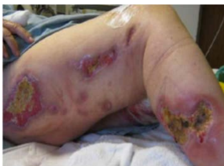
Figure 2. Right lateral leg wounds

Three months following that second hospitalization, the patient was admitted to our general medicine department with decreased perfusion of her right index finger and fever in the setting of progression of her painful necro-ulcerative cutaneous lesions [Figure 1c, Figure2].