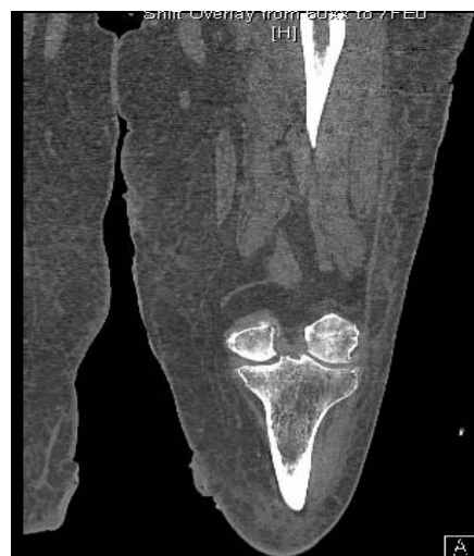
Figure 3b. Angiogram showing multiple shallow skin ulcerations along the medial and lateral aspect of the thigh with no evidence of calcification

An initial biopsy of one of the lesions on the patient's left leg revealed focal vascular thrombosis resulting in chronic ischemic changes. A punch biopsy of one of the lesions on her left tibia a week later showed fibrin thrombi in superficial dermal vessels with no active neutrophilic vasculitis. Angiography of both upper and lower extremities showed multiple shallow skin ulcerations with no calcium deposition in the small superficial vessels. [Figure 3a-b].