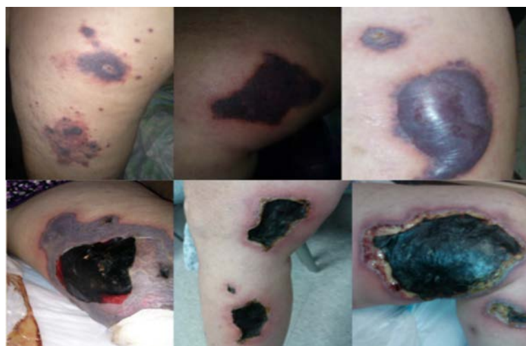
Figure 1 b-c. Erythematous rash evolved into a flaccid bullas and the painful eschars