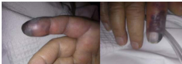
Figure 1a. Ischemia of the right index

The first of these lesions appeared nine months prior to presentation as a nickel-sized erythematous rash on the anterolateral surface of the right lower surface of the tibia. This occurred during a hospitalization at an outside hospital for sepsis with E. Coli bacteremia secondary to a urinary tract infection (UTI). Within a few days, the rashes grew larger and developed into vesicles and then flaccid bullae with leakage of serosanguinous fluid. Located predominantly on her hip, back and lower extremities, these bullae later evolved into painful eschars [Figure 1b].